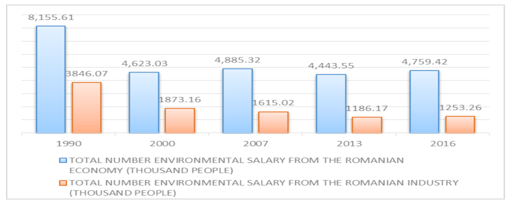
Chart no. 2. Average number of employees in the Romanian industry vs. average employees in the Romanian economy (thousands of people)

Next, we conducted an analysis of the evolution of the average number of employees in the Romanian industry compared to the average number of total employees of the Romanian economy taking into account the data provided by the National Institute of Statistics website for the years: 1990, 2000, 2007, 2013, 2016.